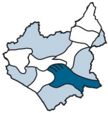
Leicestershire Learning Disability Partnership Board