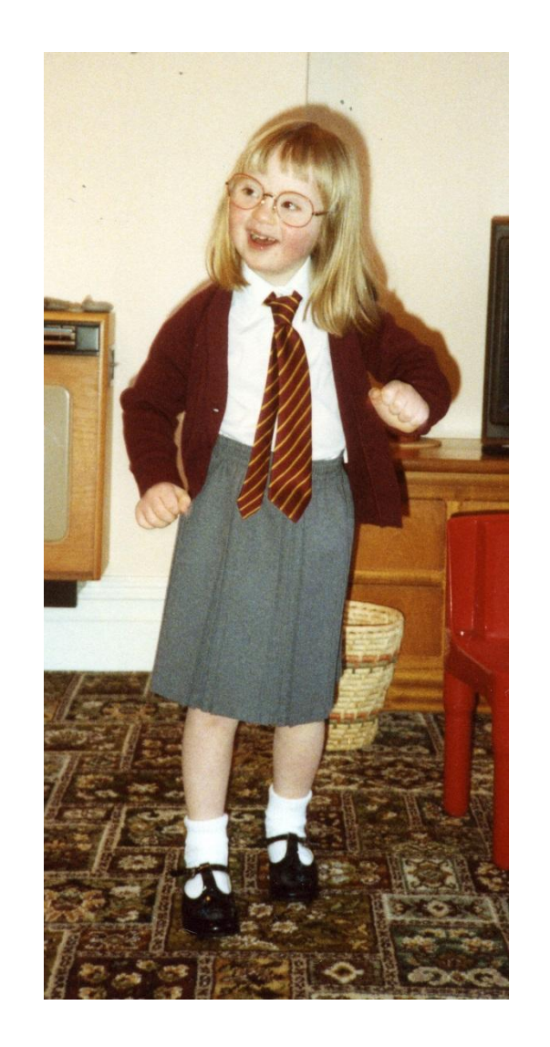
Excited!! First day at school Aged 4 and three quarters