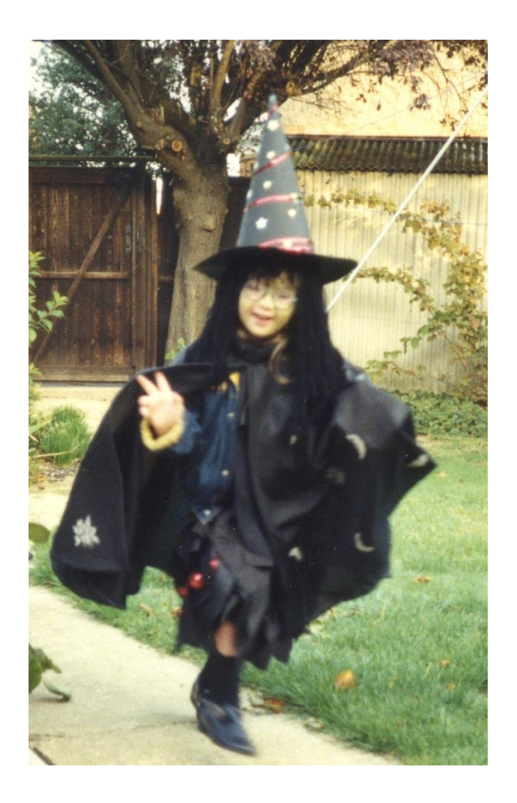
Aged 7 – Halloween time