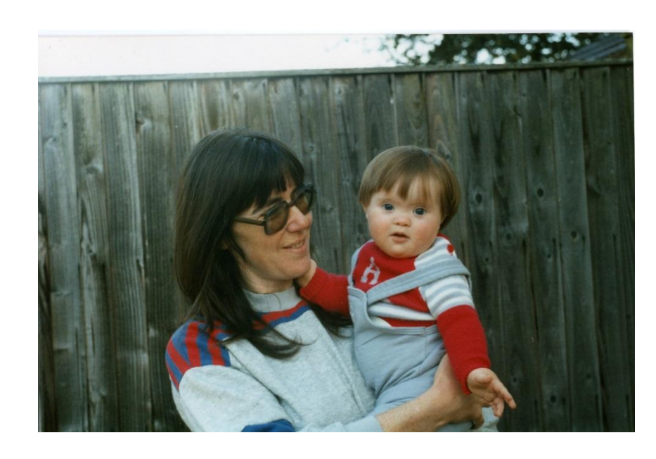
Aged 10 months