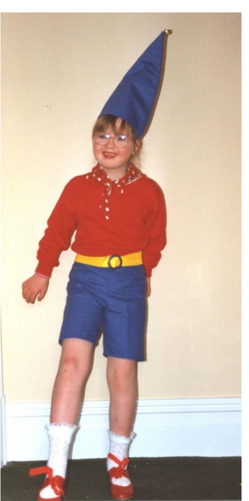
Noddy – aged 6 Before knee problems