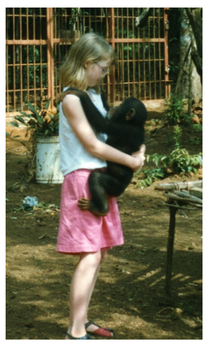
Aged 9 – with baby chimp