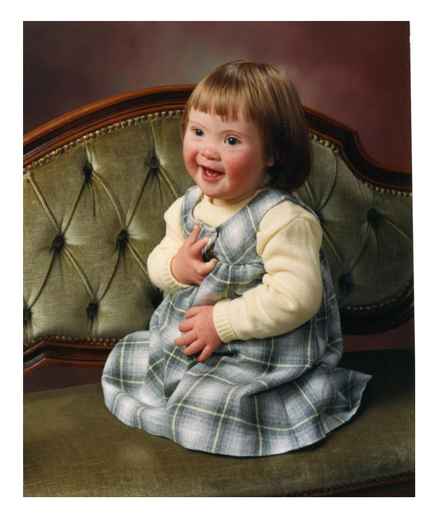
Aged 18 months