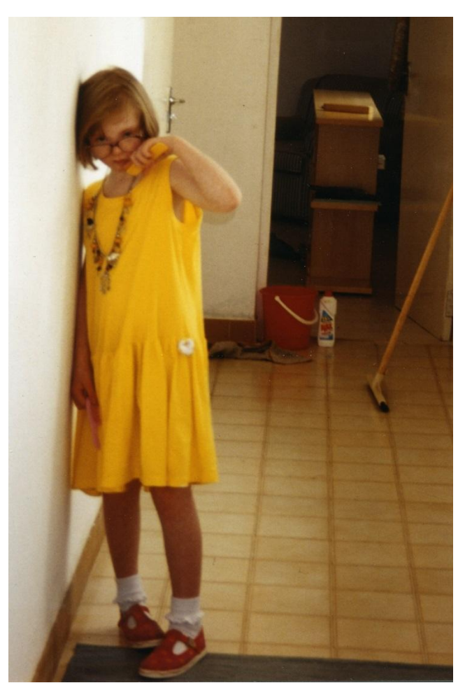
In Africa - Aged 9